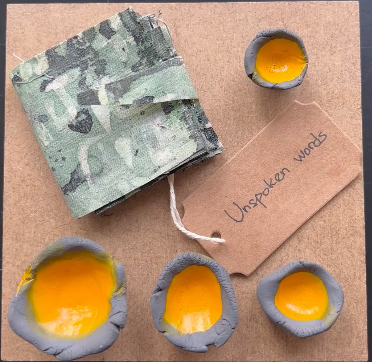
Unspoken Words II, 2025. , 15x15x3 cm