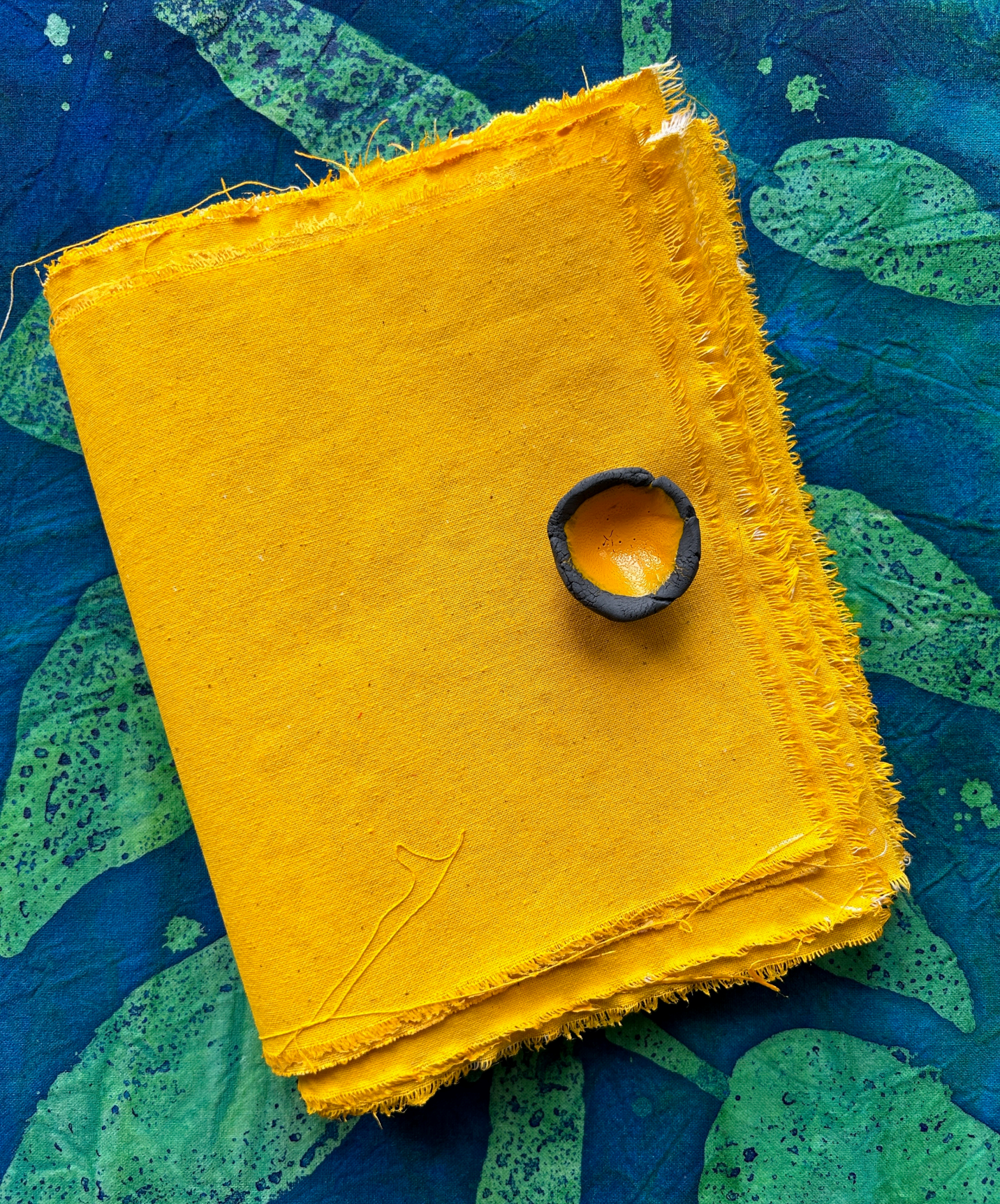
Book of Prayers, 2025. , 15x19x3 cm