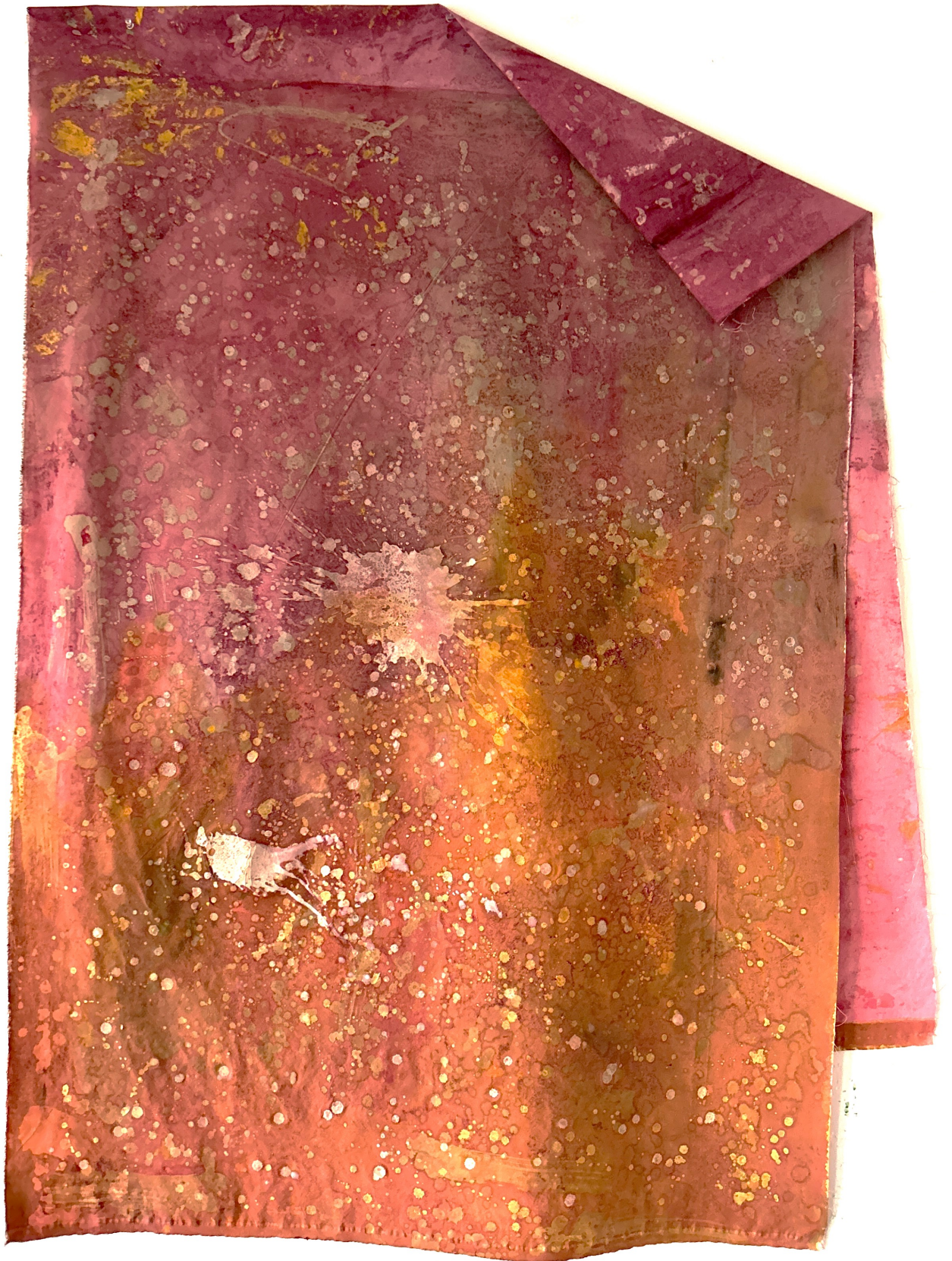
Rosy Dawn Pergament, 115x 152x2 cm