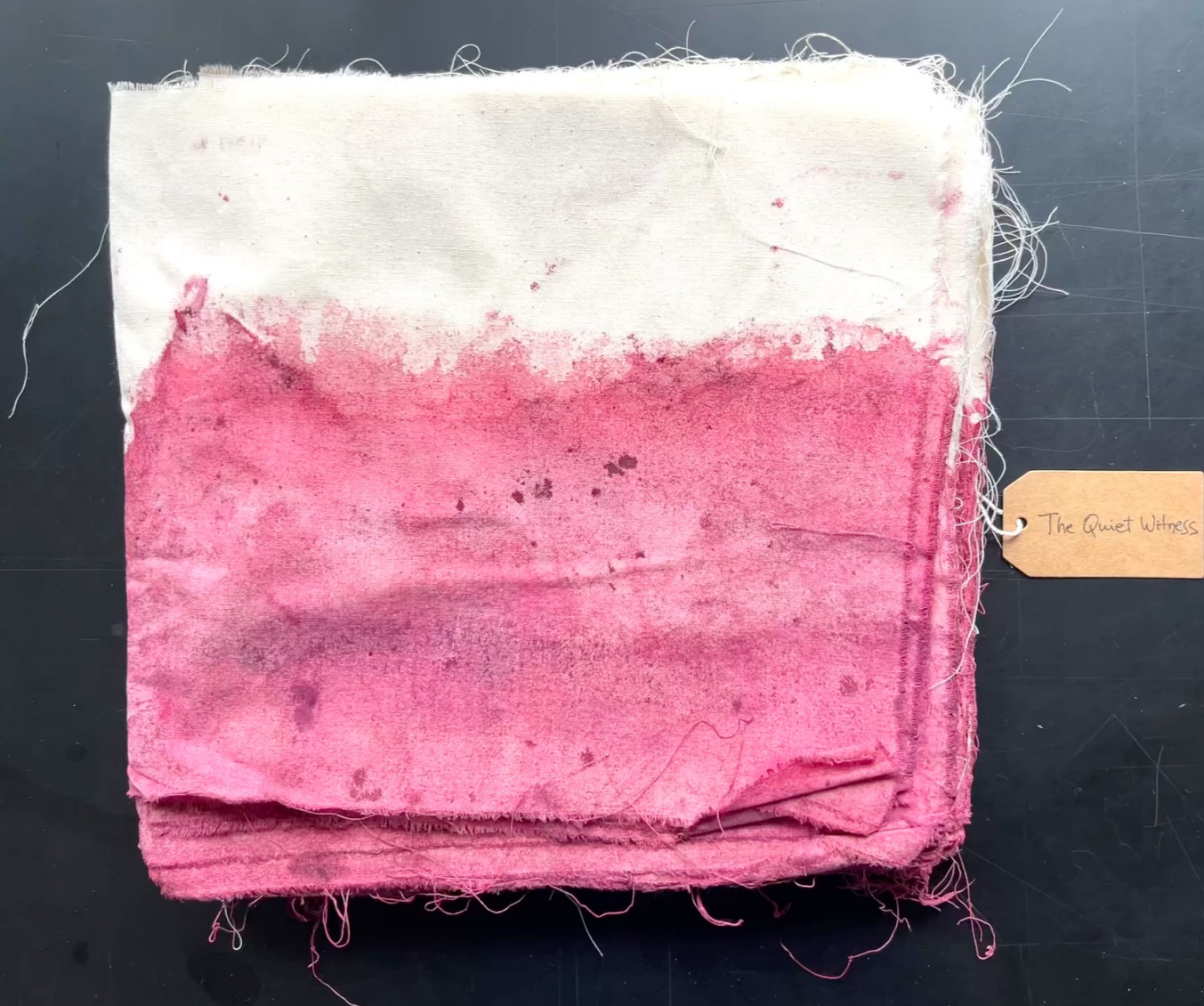
The Quiet Witness, 2025. , 28x30x7 cm