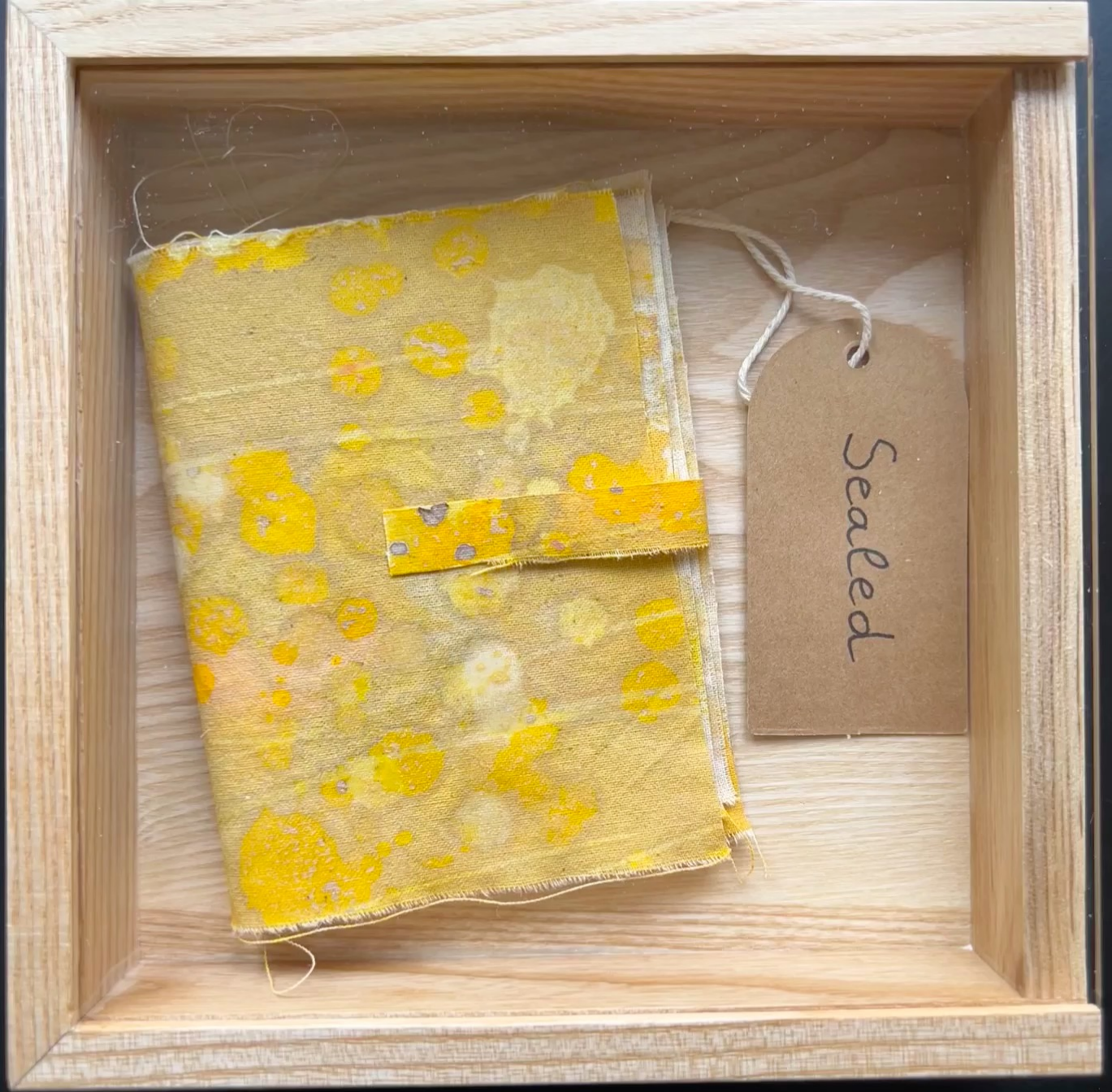
Sealed, 2025. , 17x17x3 cm