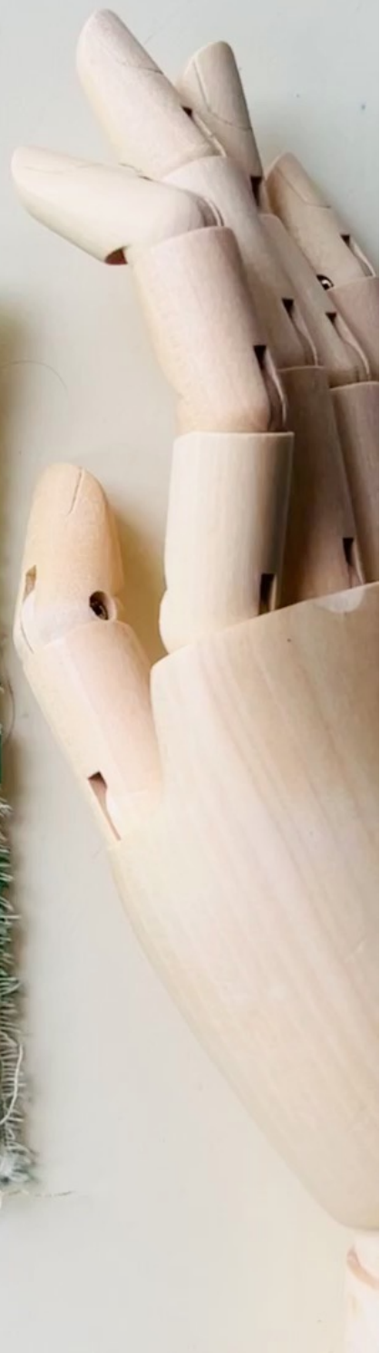
Forgotten Stories, 2025. , 14x15x2 cm