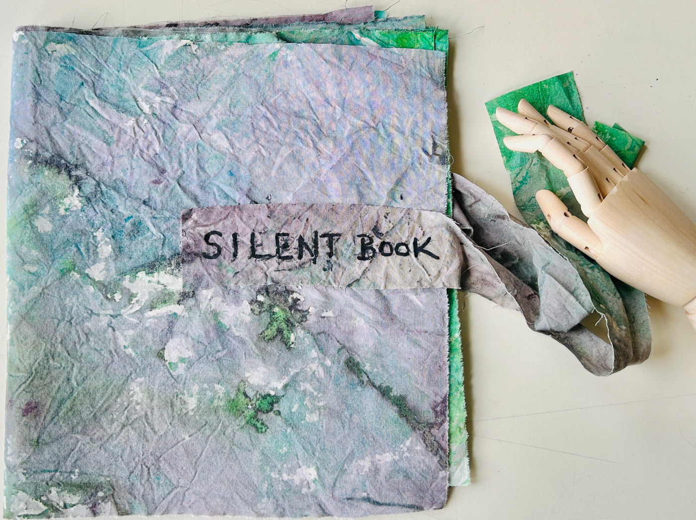
Silent Book, 2025. , 30x35x2 cm