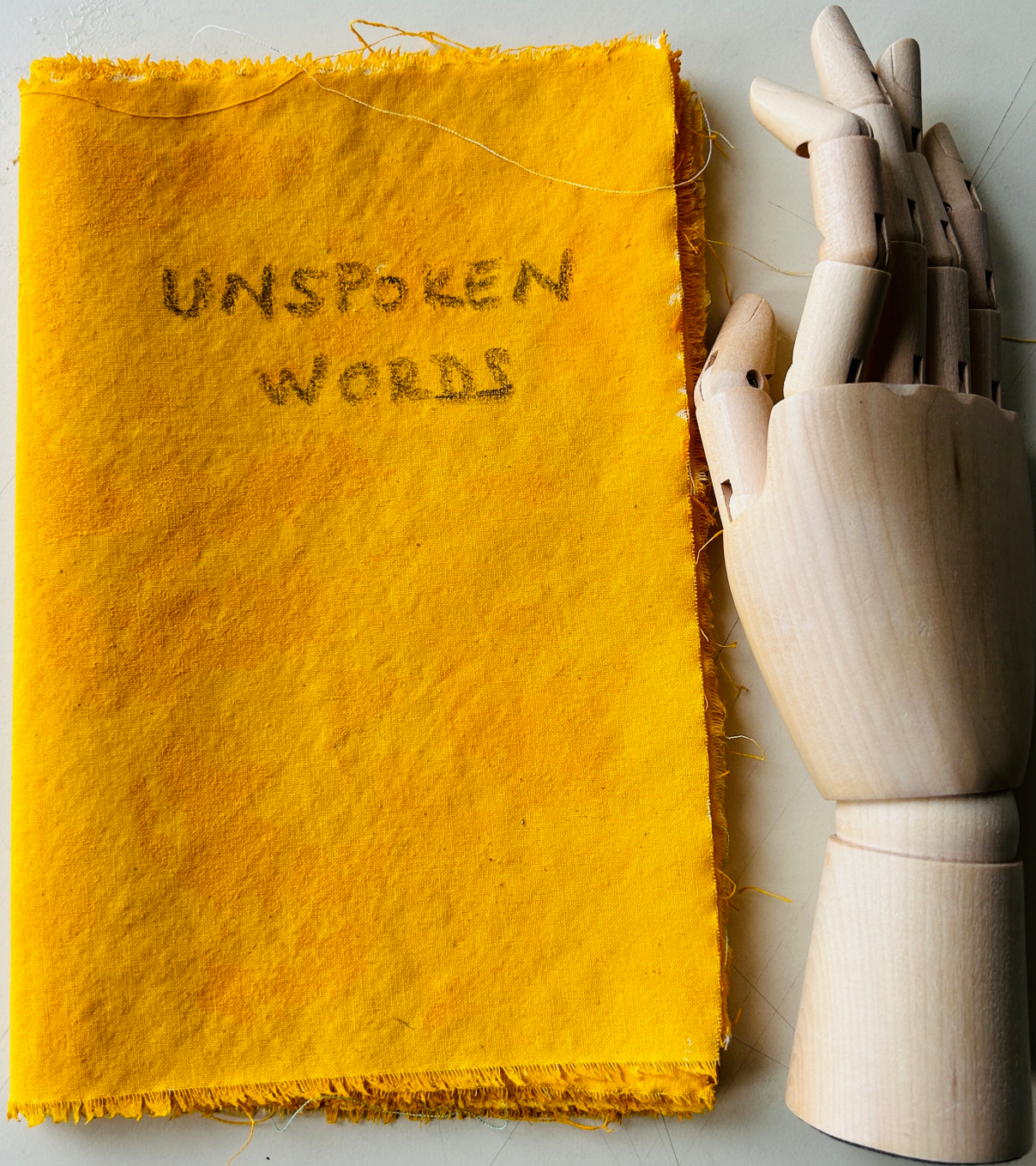
Unspoken Words, 2025. , 26x16x2 cm