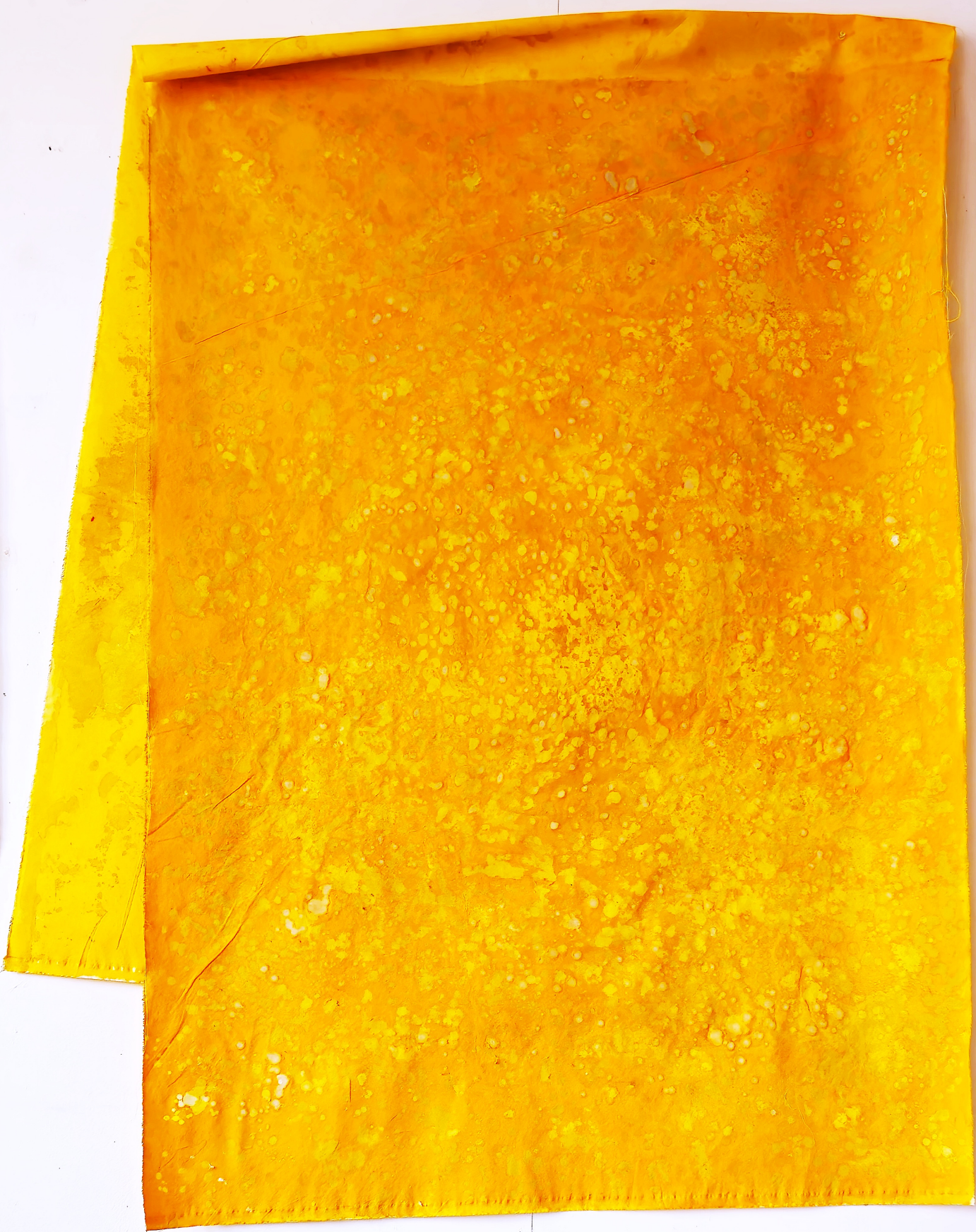
Notre Dame Parchment, 115x 152x2 cm