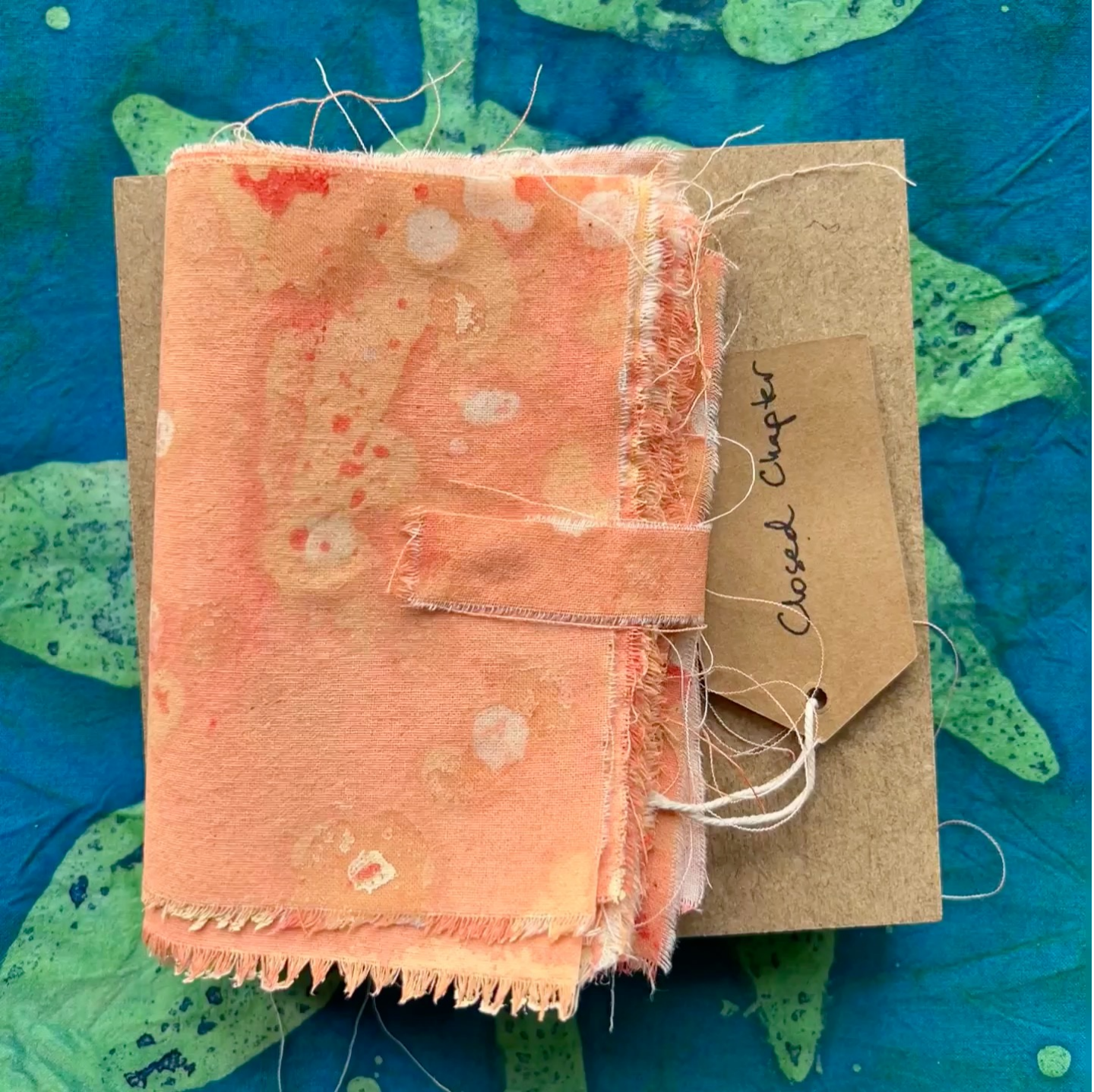
Closed chapter, 2025. , 15x15x3 cm