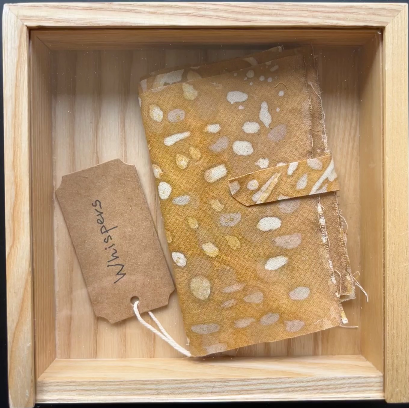
Whispers, 2025. , 17x17x3 cm