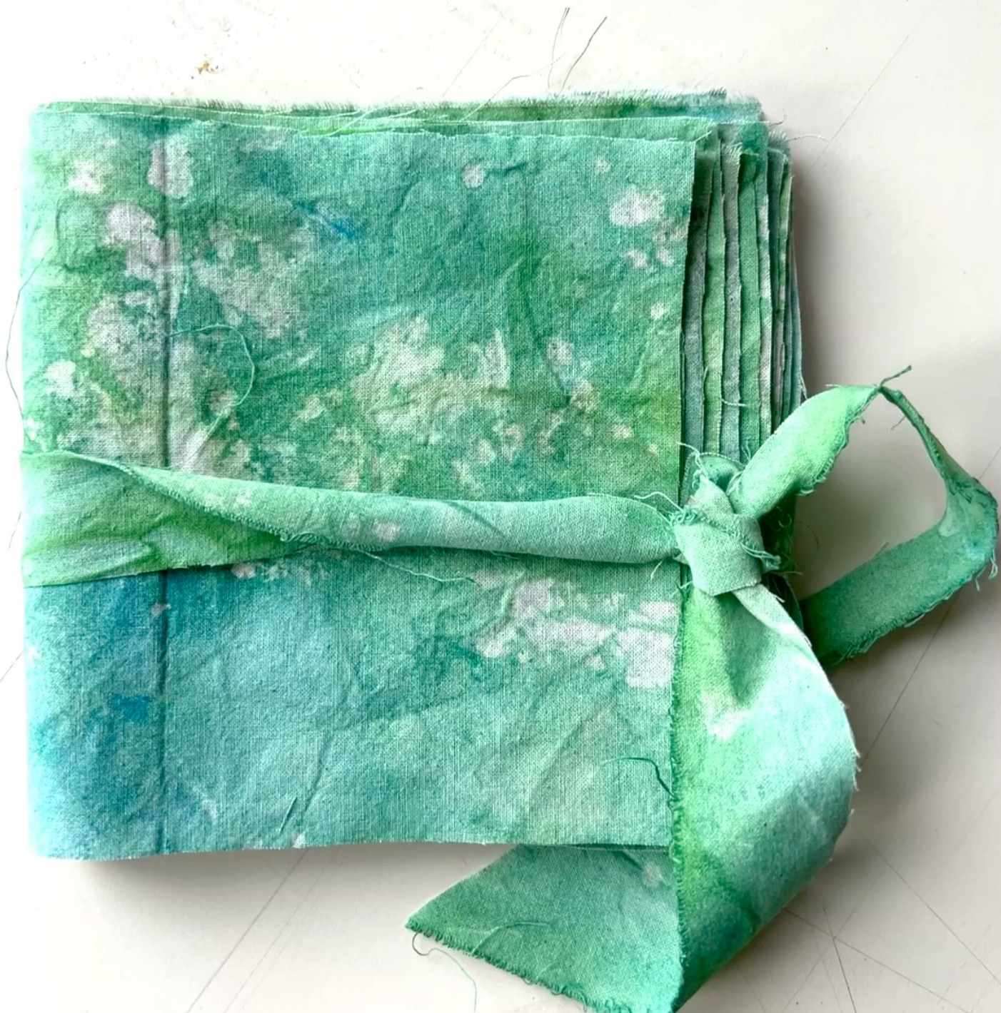
Fragments of Silence, 2025. , 18x17x3 cm