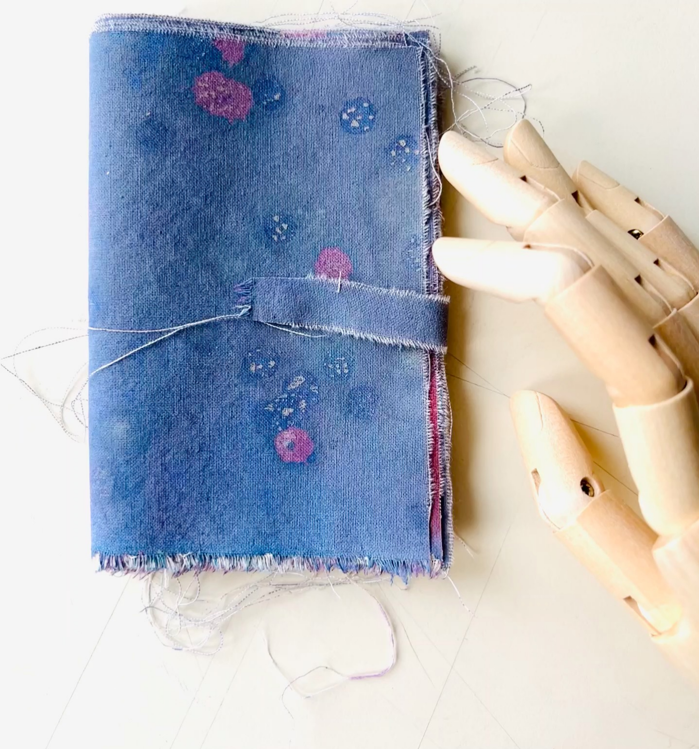
Dream Interpreter, 2025. , 9x14x2 cm